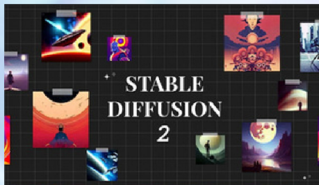
STABLE DIFFUSION 2