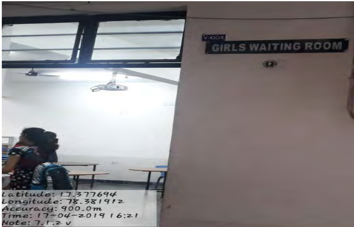
Girls Waiting Room - V-004