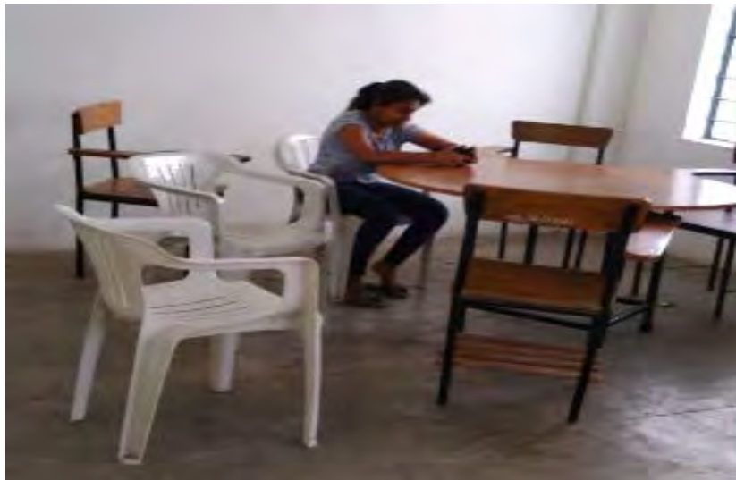
Girls Waiting Room(Inside) - C-105