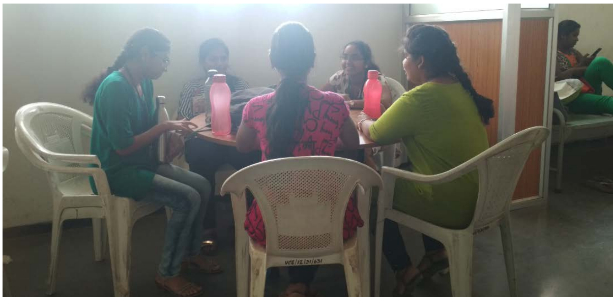
Girls Waiting Room(Inside) : J-213