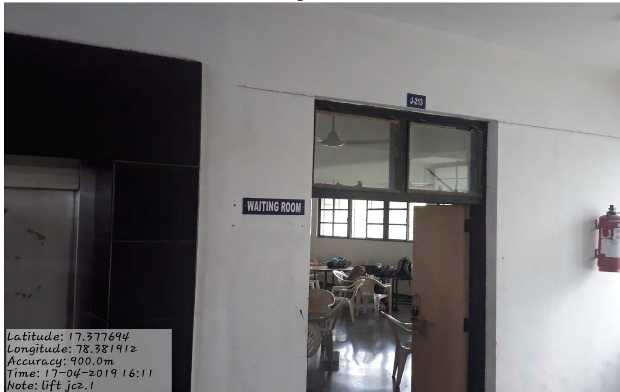
Girls Waiting Room : J-213